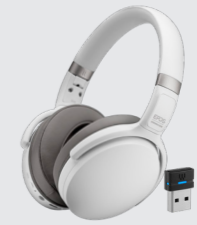
ADAPT 360 white